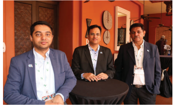
Exhibitors from CQ Tech. Examination Consultancy Services at the Conference