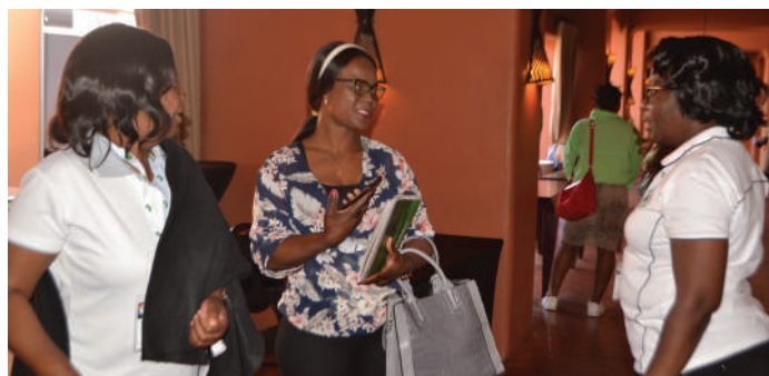
Local Organising Committee Members planning for the afternoon conference activities