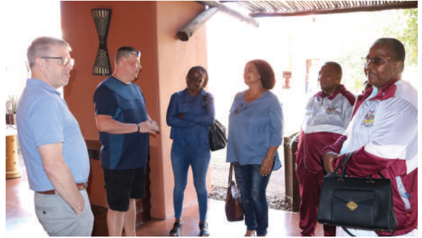
Delegates having a light moment after registration at the Conference venue