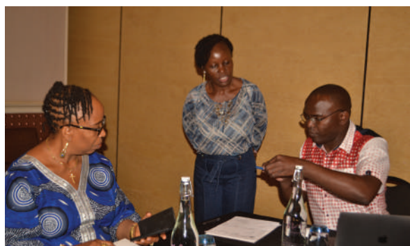
Delegates confer after a training workshop