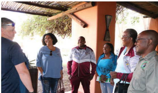
Delegates having a light moment after registration at the Conference venue