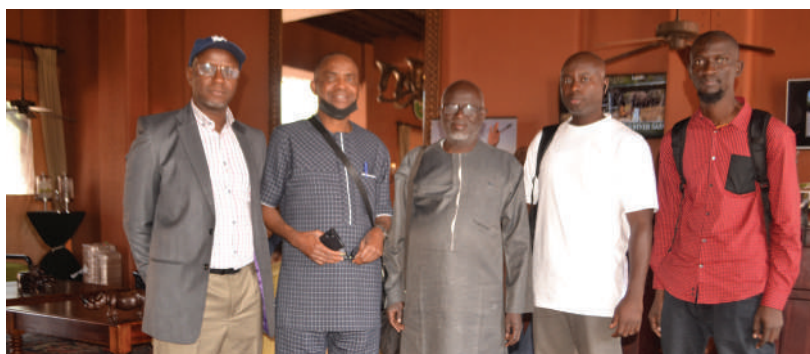
Some of the delegates preparing to attend a training