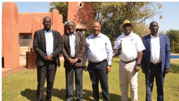
Delegates pose for a photo near the Avani pool side