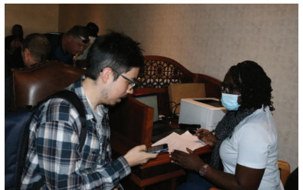
Registration of delegates for the Conference