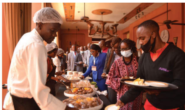
Avani serves snacks to Delegates