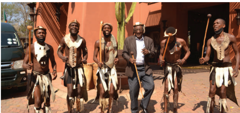
The Ngoni Warrior Cultural group entertaining a delegate at the conference venue.