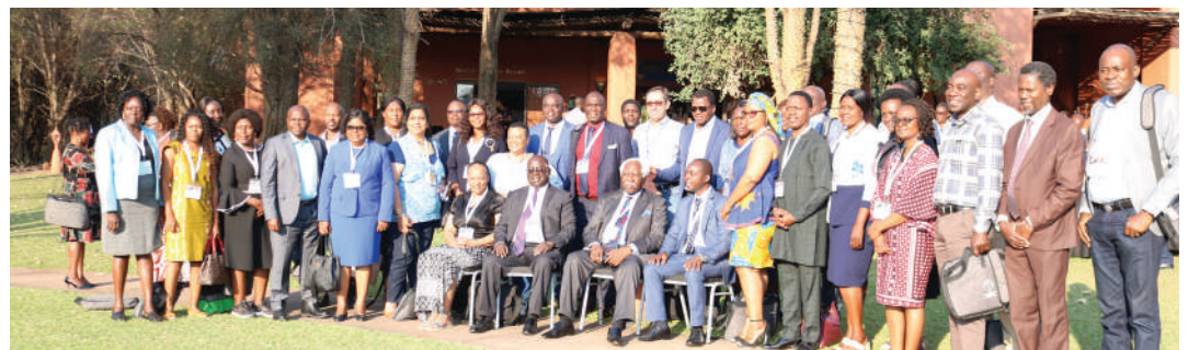
Delegates pose for a photo after the Corporate Governance Training Workshop