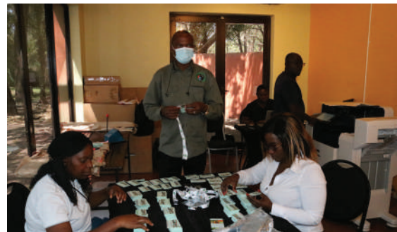
LOC Members preparing delegate IDs