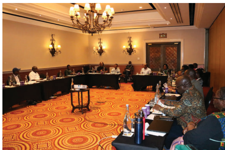
Some of the AEAA EXCO Members in attending the meeting

The Local Organising Committee in Zambia also gave a report on the preparations for the 38 th Conference to which it was reported that over 155 abstracts were received out of which 13 were rejected. A total of 80 full papers were received from different countries for presentation at the Conference. In terms of delegates and participation, the LOC indicated that the 38 th Conference was expected to host over 300 delegates and that preparations had reached advanced stage but on-going.