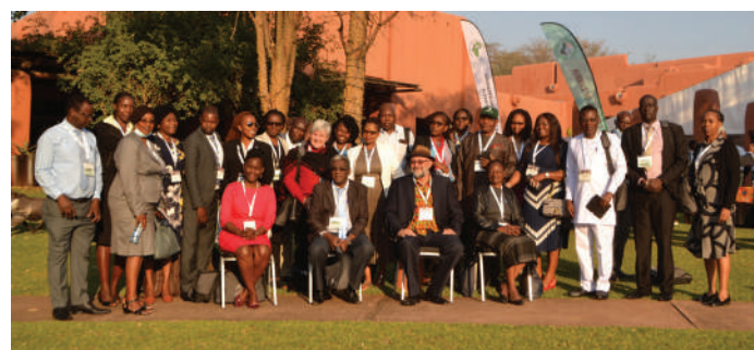
Delegates pose for a group photo after the Psychometrics in Educational Assessment Training Workshop

The workshop recommended the use of IRT as a reliable model in test construction because it brings the characteristics of people and characteristics of items together.