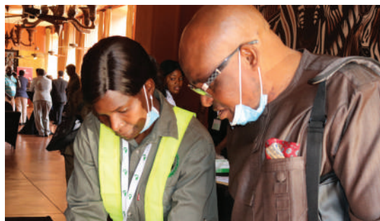
A delegate collecting conference materials