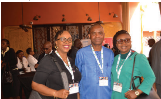
Delegates pose for a photo